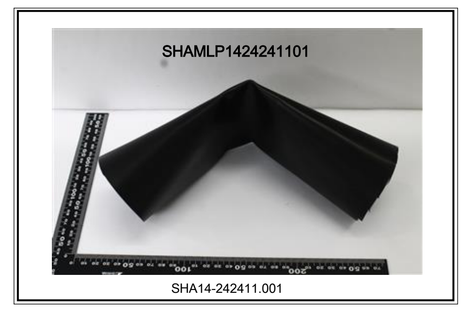
SGS authenticate the photo on original report only