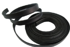
EPDM热缩管 EPDM heat shrink tubing