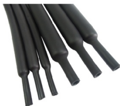
带胶热缩管 Dual wall adhesive lined heat shrink tubing