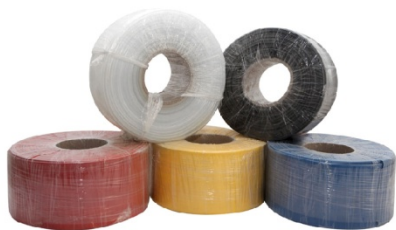
1KV/10KV/35KV 母排热缩管 Heat shrink busbar sleeve