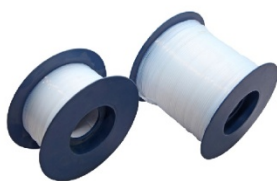
铁氟龙套管 Teflon tubing