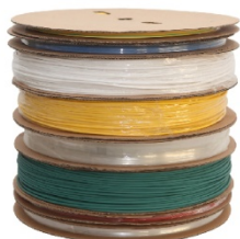
环保热缩管 Environmental friendly heat shrink tubing