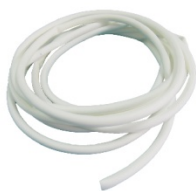
硅橡胶热缩管 Silicone rubber heat shrink tubing