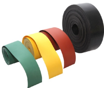
管道防腐热缩套 Anti-corrosion heat shrink sleeve