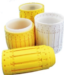
军标级标识卡 Military standard cable identification tags