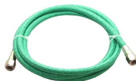
铁氟龙编织管 Stainless Steel Braided Teflon Sleeve