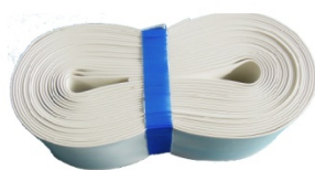
军标级连续型热缩标识管 AMS-Military grade continuous identification sleeves

Halogen free environmental identification sleeve