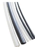
PVDF热缩管 PVDF heat shrink tubing