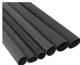
中厚壁热缩管 Medium/heavy wall heat shrink tubing