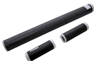
三元乙丙橡胶冷缩管 EPDM rubber cold shrink tube