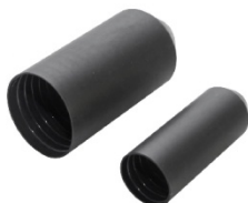
热缩封帽 Heat shrink end cap