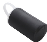
冷缩封帽 Cold shrink end cap