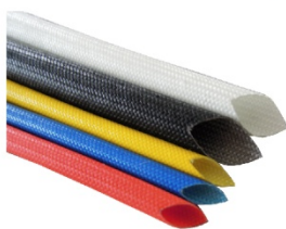
玻璃纤维套管 Fiber glass sleeving