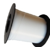
铁氟龙热缩管 Teflon heat shrink tubing