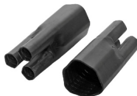
热缩指套 Heat shrink cable breakout