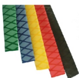
防滑花纹管 Non slip heat shrink tubing