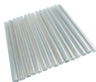
光纤热缩管 Fiber heat shrink tube