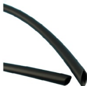
氟橡胶热缩管 Fluoropolymer heat shrink tubing