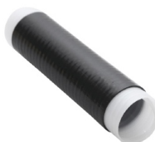
高倍率硅橡胶橡胶冷缩管 Silicone rubber cold shrink tube