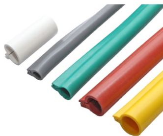
10KV/35KV/110KV/220KV 卡扣式硅胶绝缘护套管 Silicone rubber overhead line cover